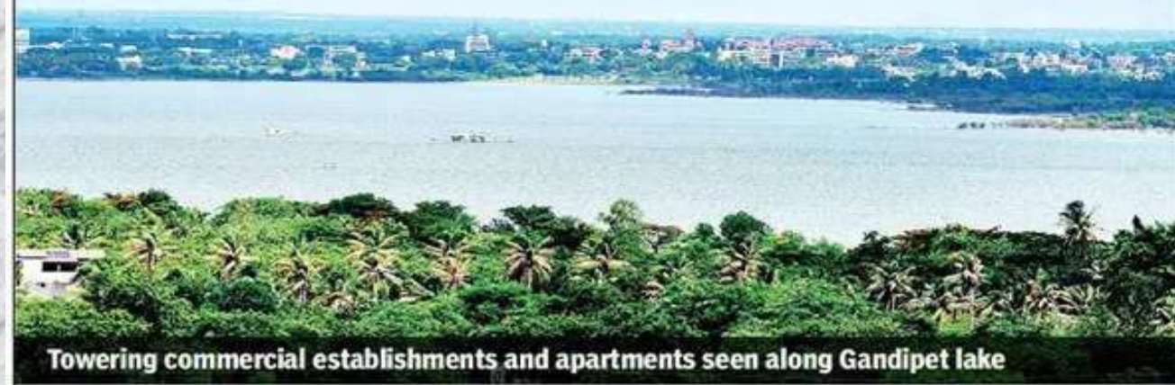
Towering commercial establishments and apartments seen along Gandipet lake

The GO prohibited the setting up of industries, residential colonies, hotels, etc. which cause pollution. The aim of the restrictions was to protect the catchment area, and to keep the reservoirs pollution-free.